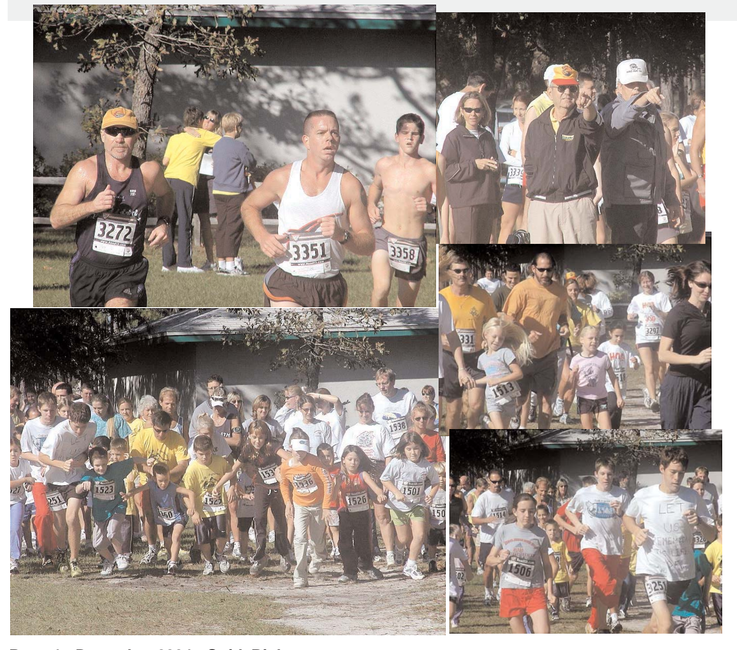
Page 4 • December 2004 • StrideRight