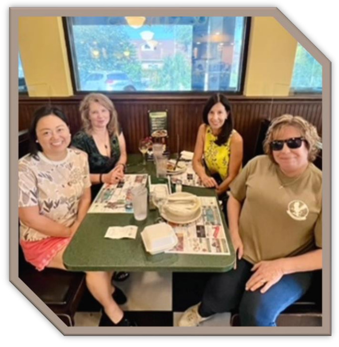
Florida Striders Planning for 2024-25 at Metro Diner.

Florida Striders continue the tradition of the Sunday morning IHOP meet-up.